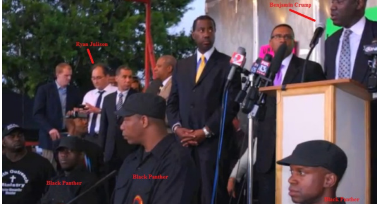
Whoopsie – Um, well lets take a look at this, shall we: The capacity of the Trayvon Martin supporters and Scheme Team to boldly lie is quite staggering. The latest *cough* claim from the schemers is their protestations that the Martin Family and family Attorneys did not support the New Black Panther Party.

All they know is lying – They have invested themselves so much in the false story they cannot even cognitively tell the difference between their lies and the Truth. Unfortunately, the same holds true for their simple-minded, sheeple supporters. Consider – Their Latest Claim: "they did not align with the Black Panthers".