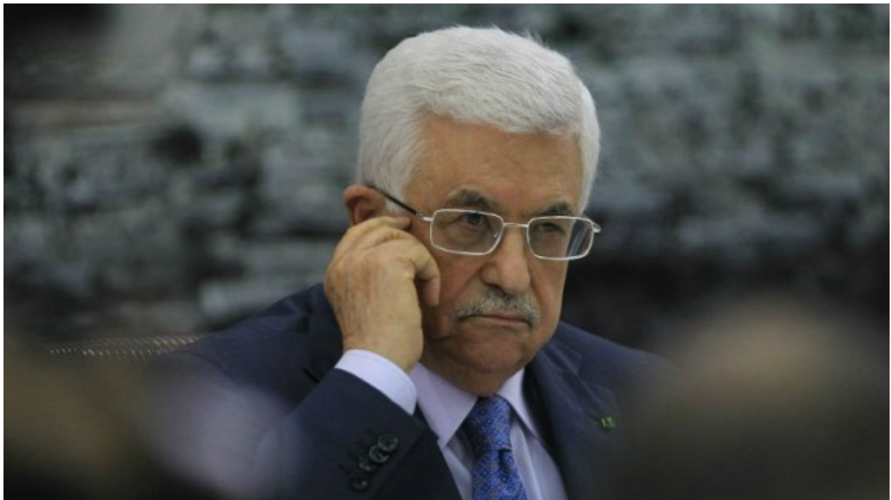
Palestinian Authority President Mahmoud Abbas looks on as he meets with members of the Palestine Liberation Organization (PLO) on July 22, 2014, in the West Bank city of Ramallah.